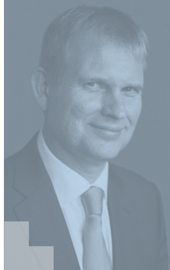
Harrie Temmink, Deputy Head of Unit, Industrial Property and Fight against Counterfeiting, DG Internal Market, Industry, Entrepreneurship and SMEs (GROWTH), European Commission

□□ The success of MoUs very much depends on the participation of key operators; the good faith of the partners to genuinely engage in an effective cooperation and the ability to objectively measure the compliance with the commitments made.